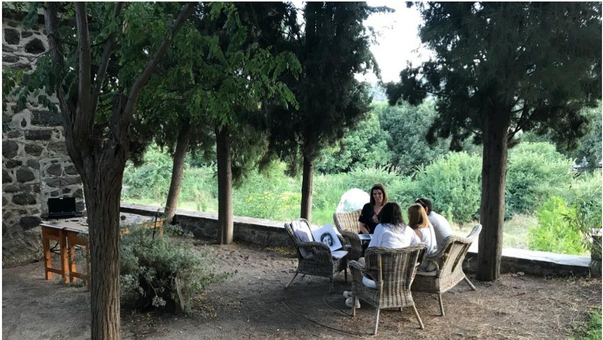
Image 1: The course takes place at Metochi study centre in Lesvos, Greece

https://www.uia.no/en/studies2/encounters-between-arts-ethnography-and-pedagogy